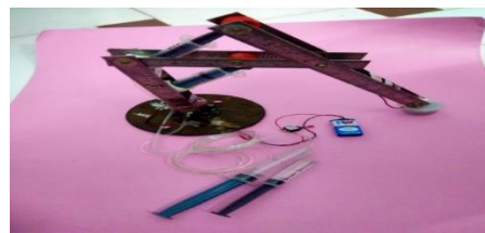
Figure.2. Pantograph Design