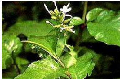
Figure: 1 Aerial Parts of Plumbago Zeylanica

Thus from this study it is concluded that emulsion polymerization in continuous aqueous phase is a better method of choice for the polymer namely polymethylcyanoacrylate for achieving nanoparticles of less than 100nm. The surface coating is found to be achieved better with PEG 4000 which is observed from the uniformity in size and spherical nature of the particle obtained. The biodegradable nanoparticles with chitosan exhibits better formation through the method of cross linking using glutaraldehyde and acetic acid.