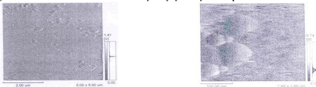
Figure: 4 Particle Size Determination Of Polymethylcyanoacrylate Nanoparticle Coated With Span 80 and Chitosan