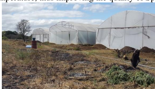
Figure.4. The use of translucent UV-resistant polyethylene film can help in reducing atmospheric contamination and pollution and control of inside air temperatures

Physical contamination: The open Spirulina production systems are prone to atmospheric pollution and contamination with insects, birds (feathers) and their droppings, plastics, soot and smoke particles (Grobbelaar, 2003). Also the freshwater attract aquatic insects such as Ephydriidae (brine flies), Corixidae (water boatmen) and Chironomidae (midges) (Grobbelaar, 2003). However by covering the open Spirulina production systems with clear 0.15 mm-thick translucent UV-resistant polyethylene film can help in reducing atmospheric contamination and pollution (Habib, 2008). These plastic covers will allow the entry of sunlight energy reduce the presence of aquatic insects and allow a control of air temperature, thus improving the quality of Spirulina (Figure 4).